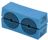
GM module with Multidiameter™